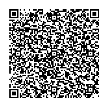
Multi-URL QR Code